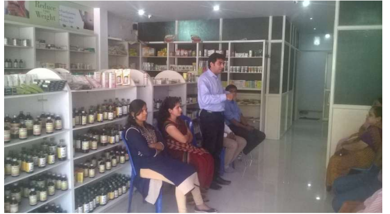
Key Note address