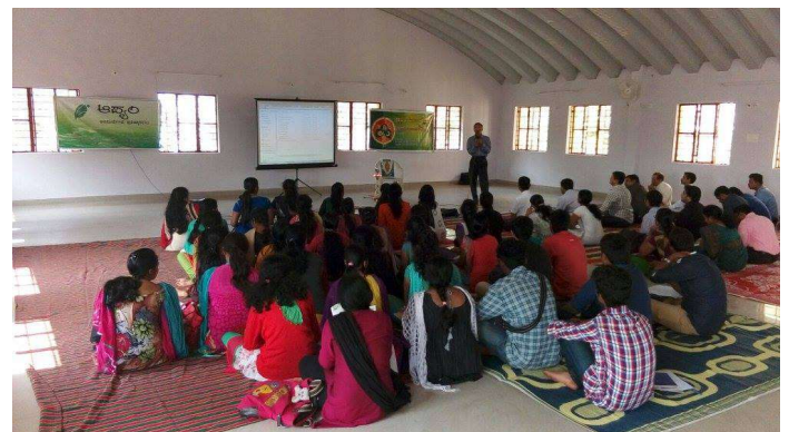
Participants of the seminar