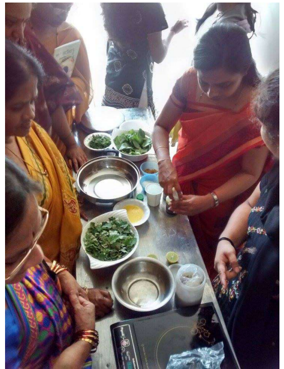
Preparing the Dishes