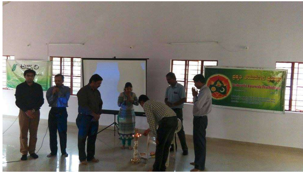
Inauguration of the programme